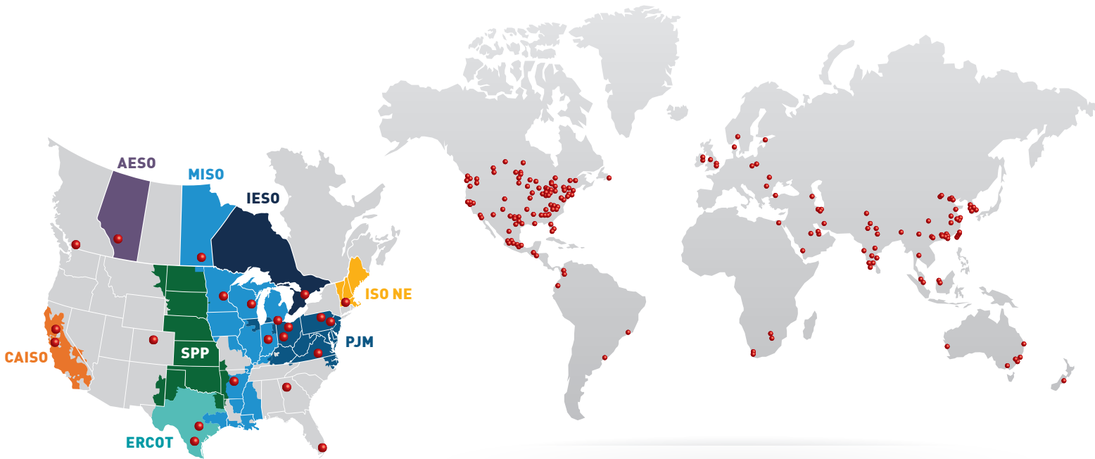
On-line DSA systems in U.S. / Canada

DSATools™ has a broad user base, which includes eight of the nine ISOs in North America and spans across six continents, encompassing some of the largest and most technologically advanced utilities and grid operators in the world. Powertech has issued over 220+ commercial licenses with more than 4,700 application seats.